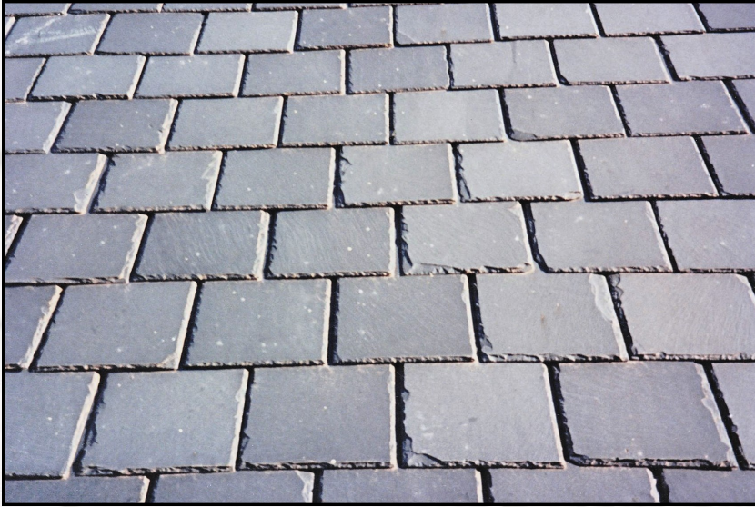
Traditional Natural Slate